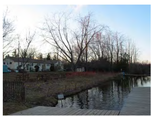
WOFGPA in the spring