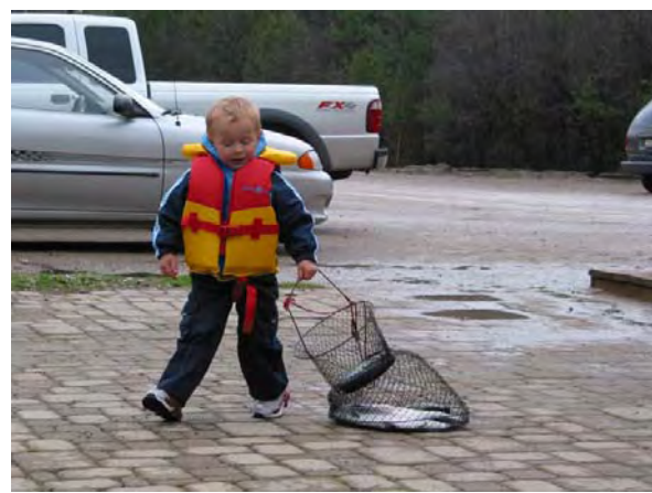
A young man's "Catch of the Day"