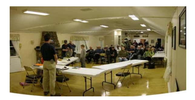
Door prize draws at WOFGPA