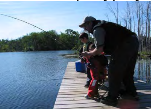
Young anglers perfecting their technique