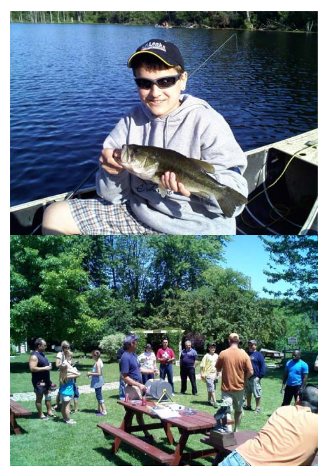
The anglers at award time.