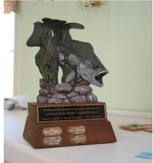
Largest Bass Trophy (photo taken July 2005)

Sunday, July 12<sup>th</sup> turned out to be great sunny day to spend the morning angling for bass and then enjoying a burger with friends while swapping "fish tales".