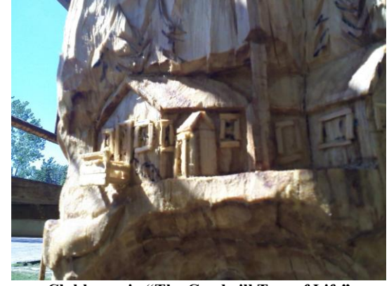
Clubhouse in "The Goodwill Tree of Life"

Remember to check both our website and Bulletin Boards for updates on upcoming events.