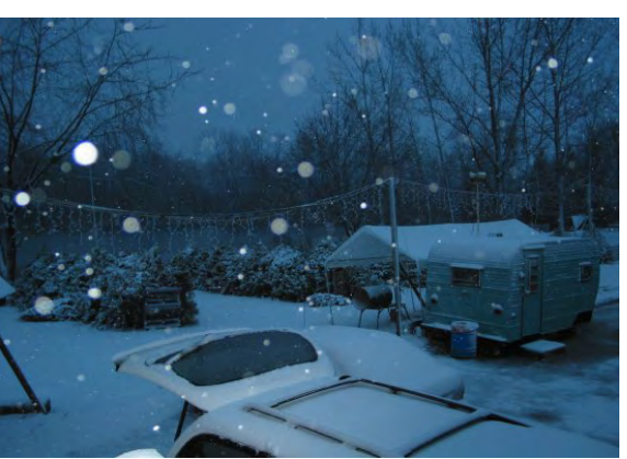
The tree lot at night