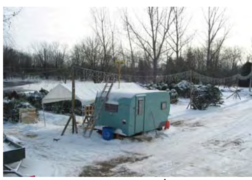
Any Tree $ 25 Any size, any shape