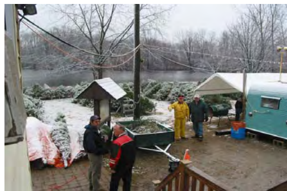
A few of the Christmas Tree sales crew