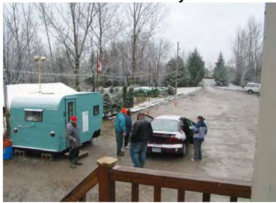
Getting a tree