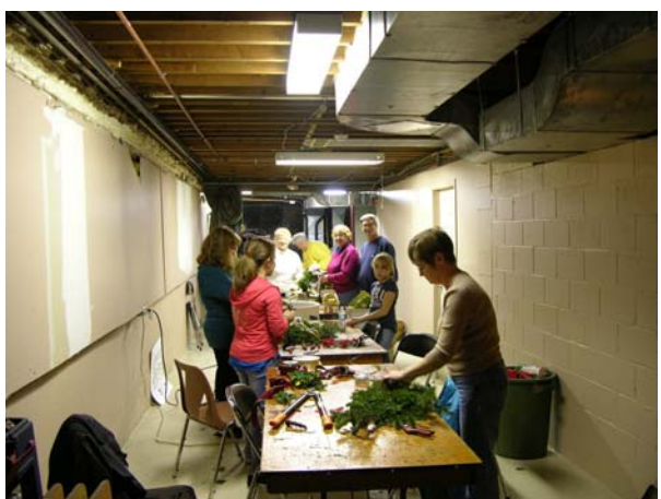
The Wreath Brigade workshop