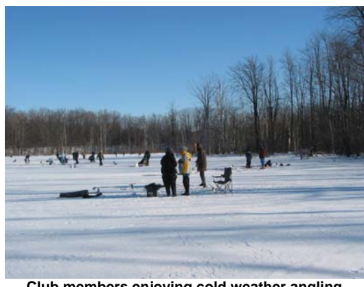
Club members enjoying cold weather angling