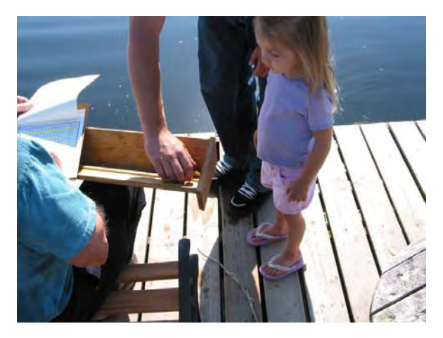
Making sure Daddy measures her fish right.

Congratulations to all winners and we hope that all the young anglers had a lot of fun. We hope to see many of these anglers back at the Summer Bass Derby on July 15.