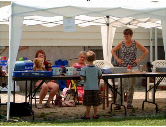
A little boy just had to ask "So ... just when are they going to draw for the prizes?"