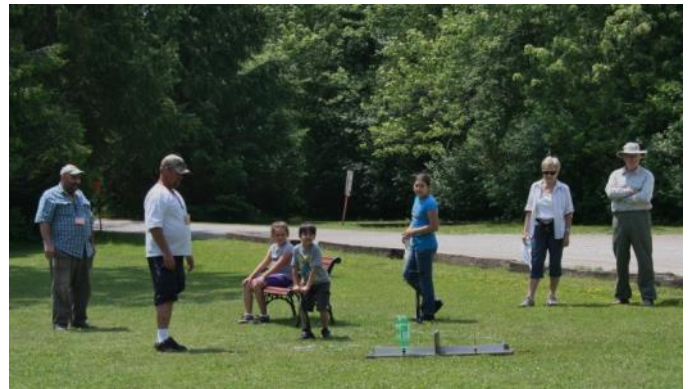
Rocket Bottle Launching