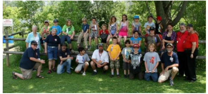
Youth Activity Day - 2013