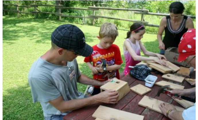
Building bird houses