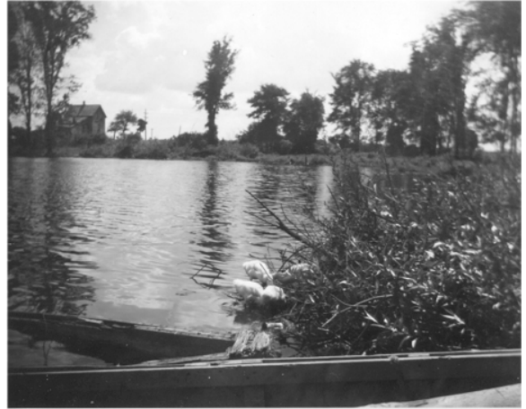
View of the Lukings house from the main lawn of the club