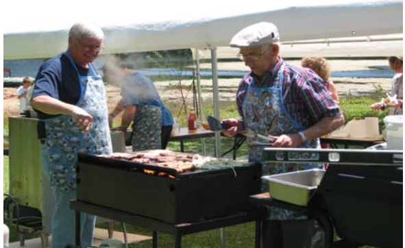
There is a lot of great food to be eaten. Did I mention that the kids get tickets at the gate so they eat for free?