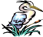
Taxidermy and Wildlife display by Greg Balch