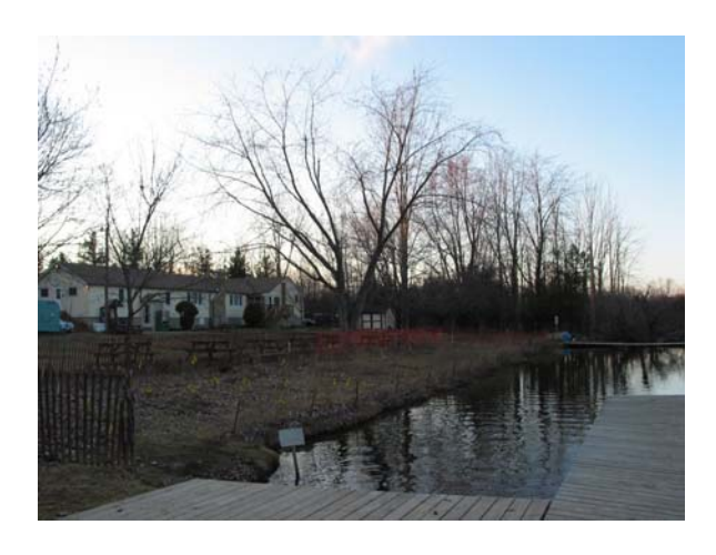
WOFGPA in the spring