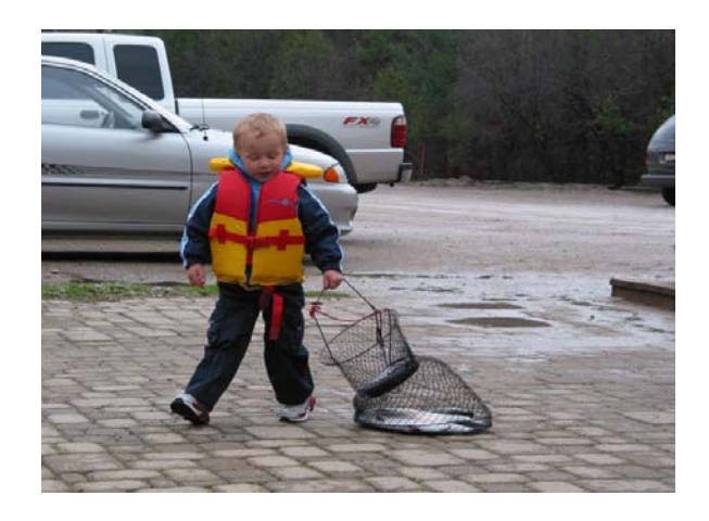
Young angler with his Catch of the Day