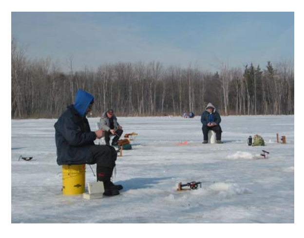
This is what ice fishing is all about!