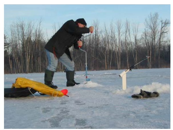
Are you sure the ice is only 8 inches thick?