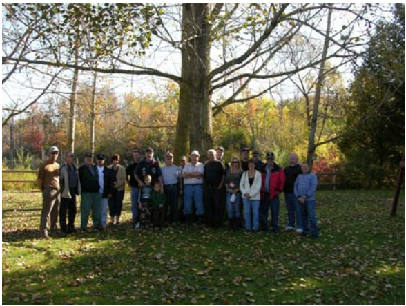
Group photo in front of Poplar tree - Oct. 12, 2008