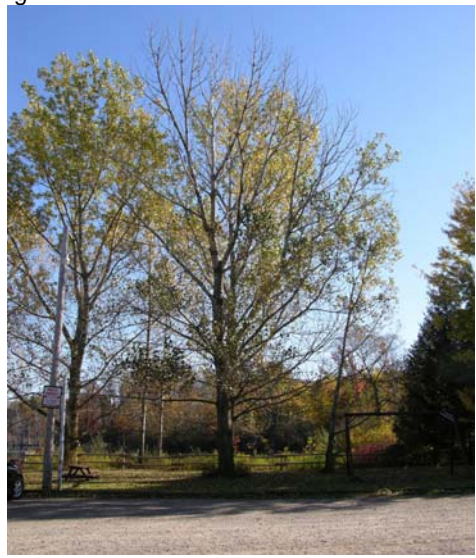
Poplar tree to be carved

On the main lawn of the club was a large Poplar tree, which has been brought down and is being readied for carving.