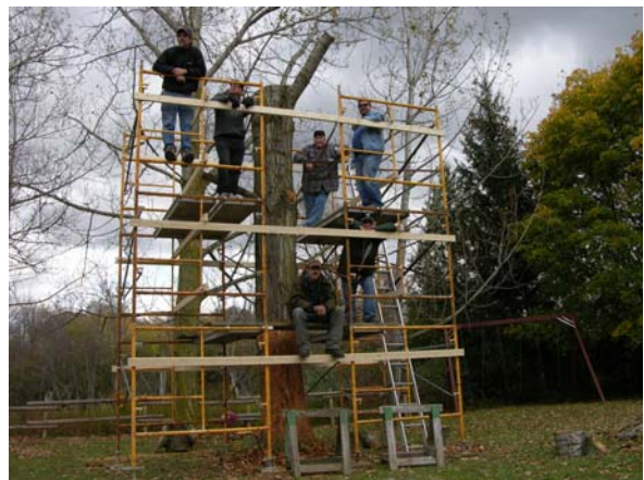
Scaffolding set up crew

If you have visited the club lately, you will notice that the front lawn looks very different. The top section of the Poplar tree on the front lawn has been removed.