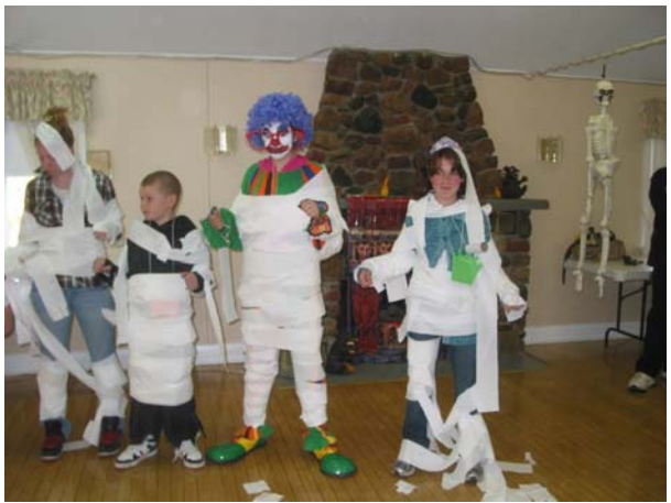
Even more mummies