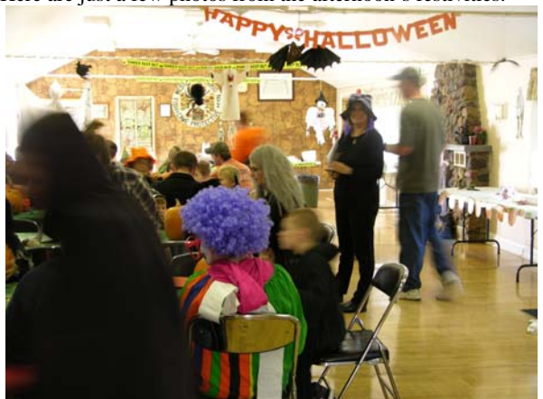
Welcome to the party - Come on in

Here are just a few photos from the afternoon's festivities.