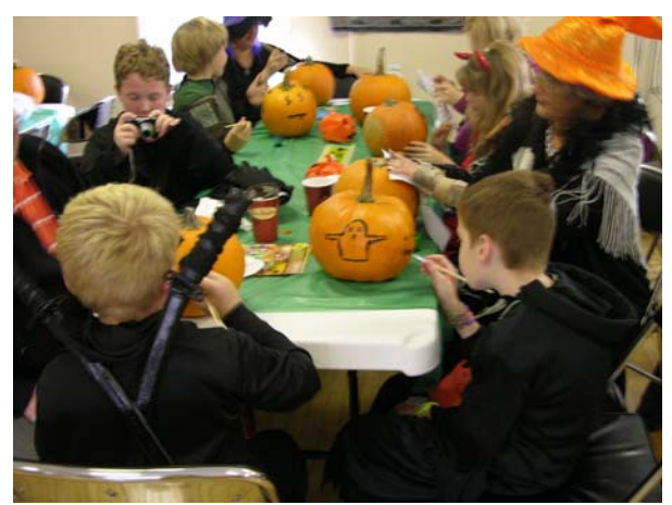
Such an effort went in to painting their pumpkin just right