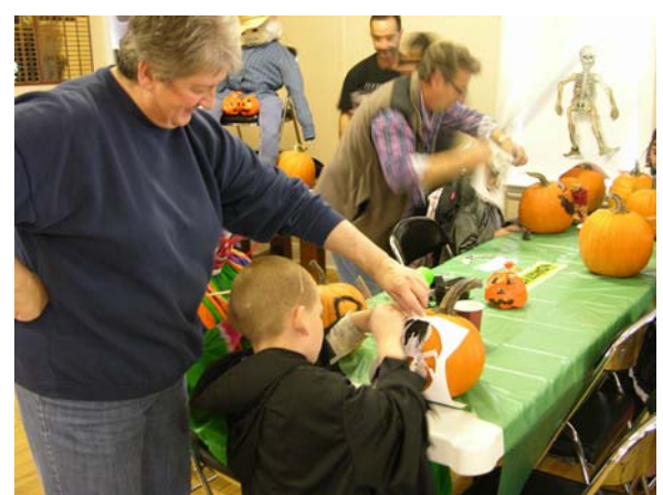
Pumpkin artists needs help now and then holding their pumpkin at just the right angle