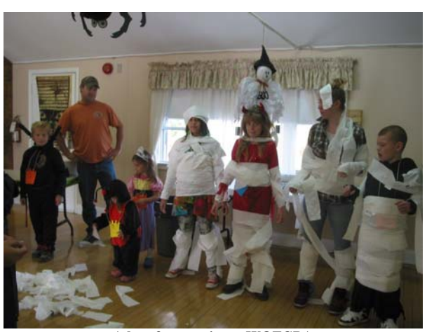
A lot of mummies at WOFGPA