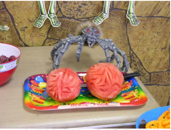
... And to think that the kids ate "Brain Food" and liked it.