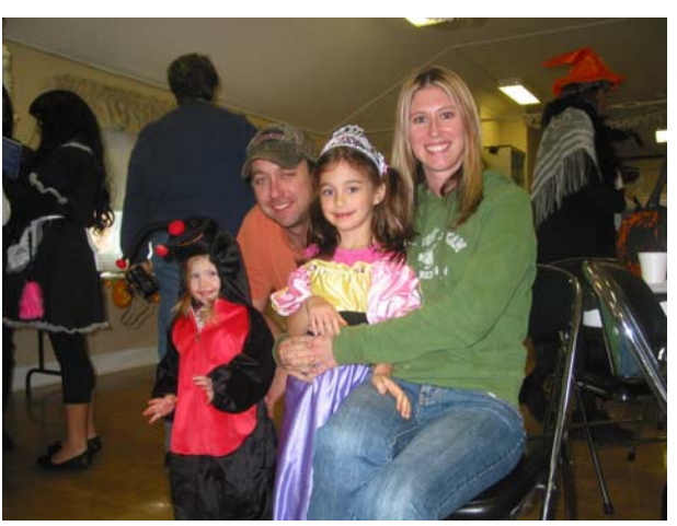
Halloween is truly a family affair