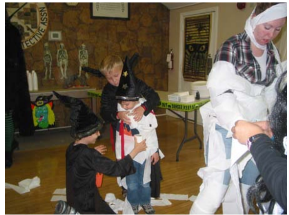
Mummy making takes lot of practice