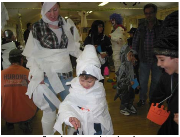
Becoming a mummy is tough work