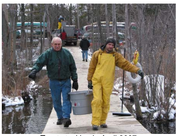
Trout stocking in April 2007