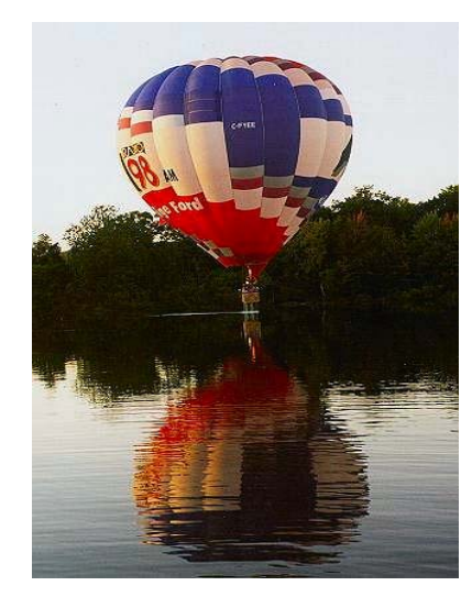
A hot air balloon "touches down" for a brief moment.