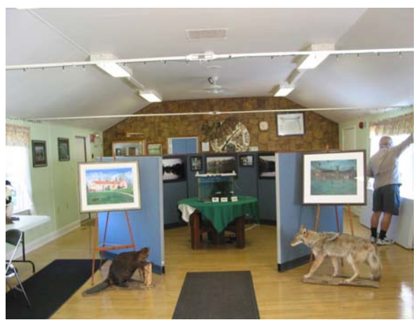
The main hall during Doors Open London.