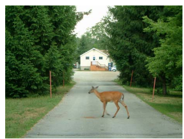
One of the many deer in the area crossing the club property.