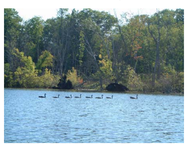
Canada geese before they head for warmer climates.