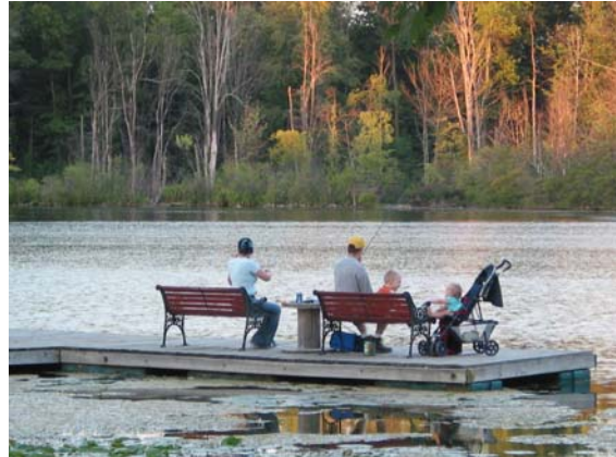
A young family enjoying Sunday afternoon.