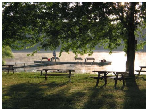
Early summer morning at Wofgpa