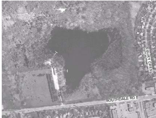
Aerial photo of Wofgpa