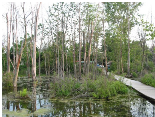
View from the back dock