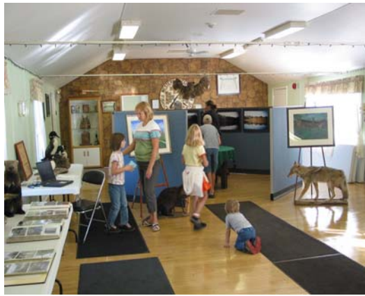
A young family gains an appreciation for our history.