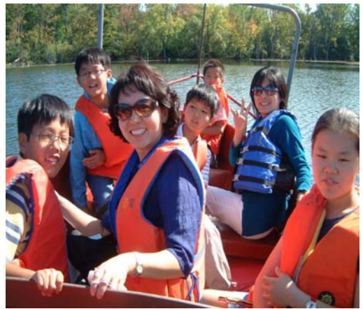
Some new Canadians smile as they enjoy a boat tour of the pond.