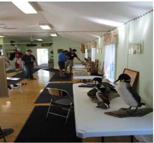
Guests learn about some of the birds that can be found in the area.