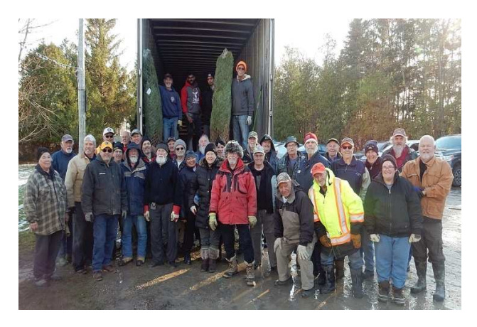
Sixty-two volunteers pledged to come and assist with unloading of the Christmas trees in mid-November

Drop in anytime to assist. No previous experience is needed and all training will be provided. Coffee, Christmas music and a good laugh or two come at no cost.