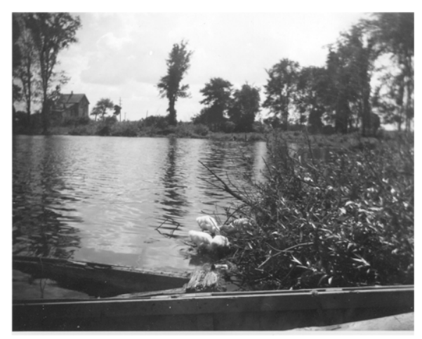
View of the Lukings house from the main lawn of the club