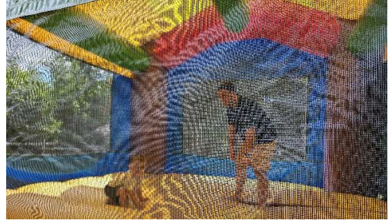
Inside the Bouncy Castle