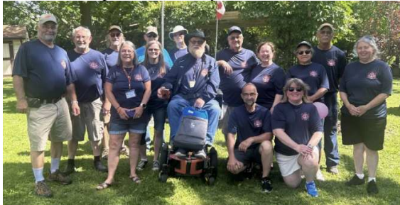
The 150 th Planning crew and volunteers