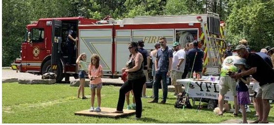
London Fire Department