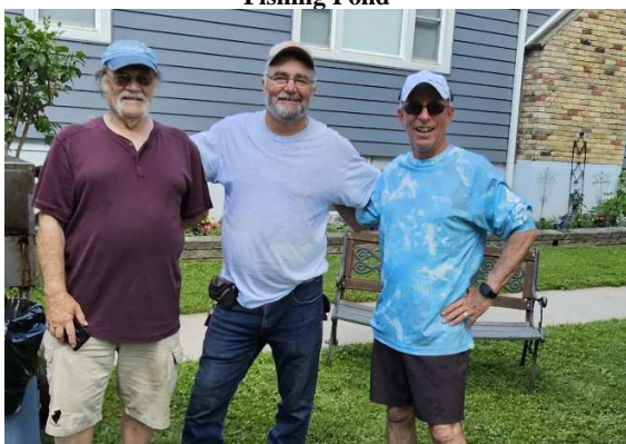
Part of the cooking team