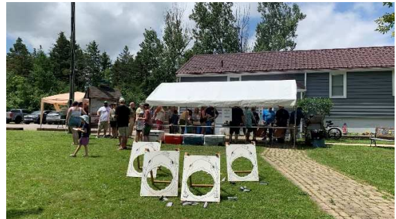
Casting and food tent