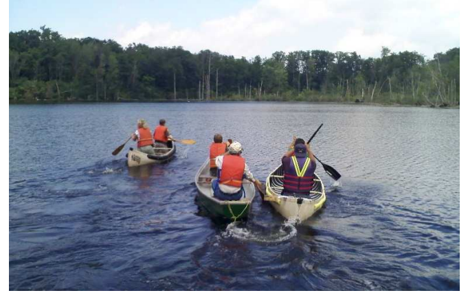
Canoe Races

If you are planning on attending the Youth Activity Day please contact Stan Gibbs in the evening and let him know how many participants you will be bringing and their ages. This is needed for a headcount to purchase enough supplies.