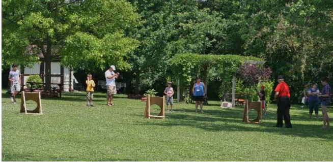
A group of youth learn to cast and hone their new-found skills (picture taken from archives)

So, if you are looking for a fun way to finish off the school year and start your summer vacation early then look no further. Bring out your children, grandchildren, neighbour's children to enjoy a day filled with a variety of activities and the wonderful environment of WOFGPA.