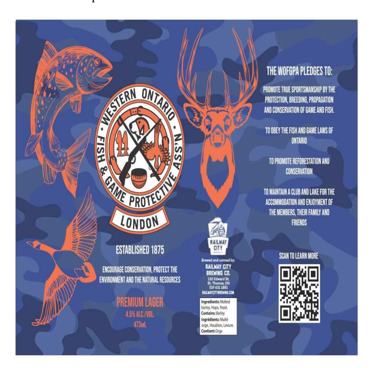
Yours in Conservation Stan Gibbs

Please support us in this fundraiser, and keep your membership rates as low as possible