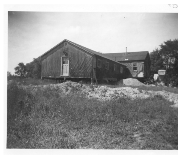
The clubhouse (circa 1949)

Be an active member of WOF & GPA and reap the all the benefits this club has to offer and not be just a "name" on a committee.